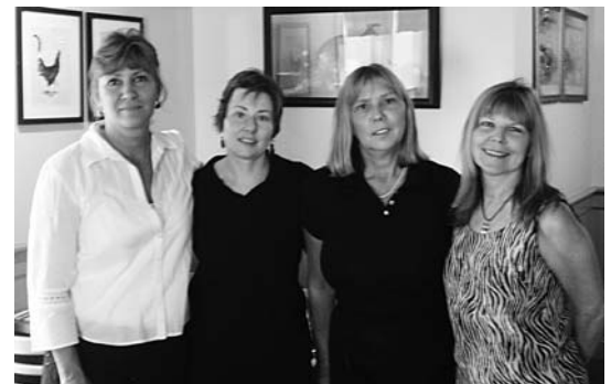
Benedict's Eggs and More